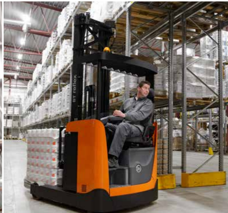
The BT Reflex B-series' controls are easy to use, making the trucks ideal for operators who carry out many other tasks during a shift. For example, the automatic parking brake and tilting forks both contribute to safety and productivity.